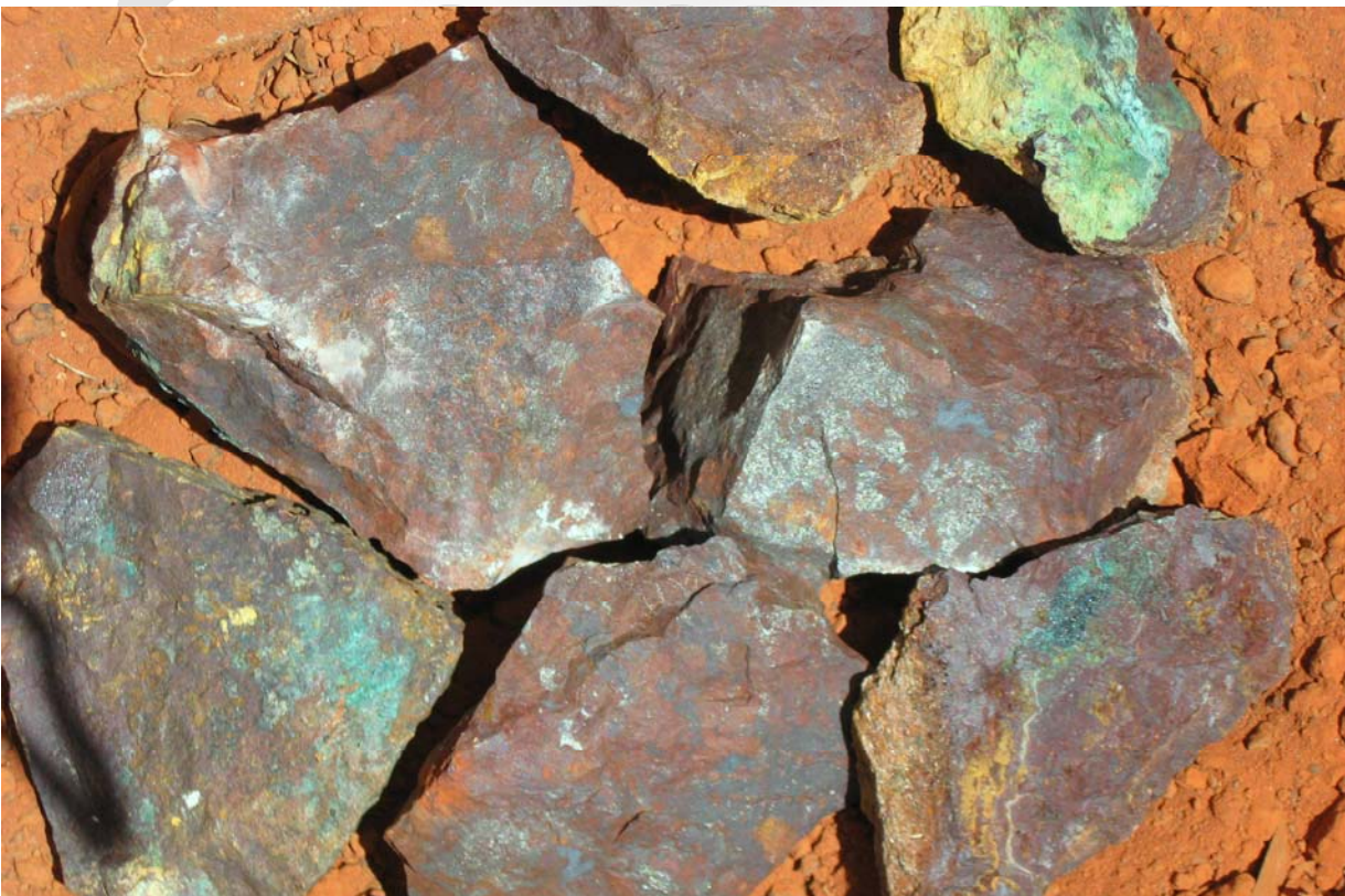
Figure 2. Samples of the Dundas gossan, with sulphide (centre of view) and secondary copper minerals (green and blue).