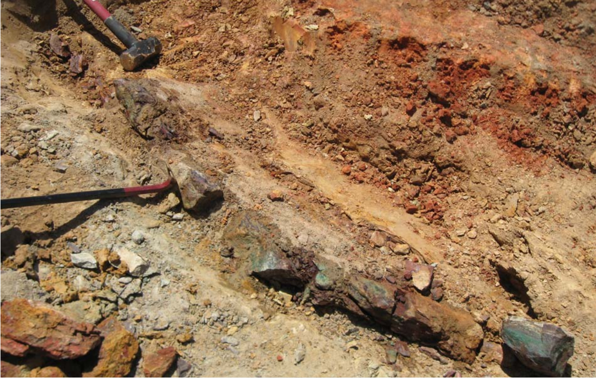
Figure 1. Dundas gossan outcrop buried beneath thin salt lake sediments.