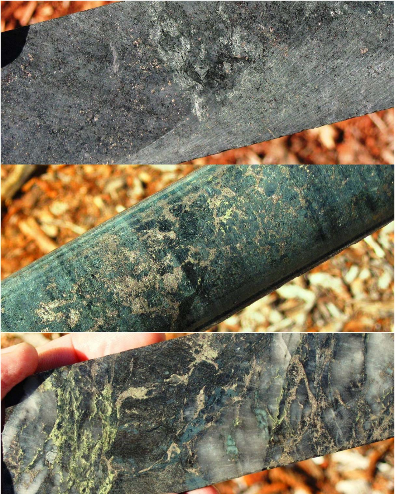
Figure 3. Photographs of disseminated (top), blebby (middle) and breccia (bottom) sulphides in SYMD0005. The bronze coloured sulphide is pyrrhotite (iron sulphide) and the brassy yellow coloured sulphide is chalcopyrite (copper sulphide). It is not possible to comment on likely grade, width or significance until assays have been received.